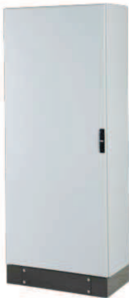
H=1600, 1800 e 2000