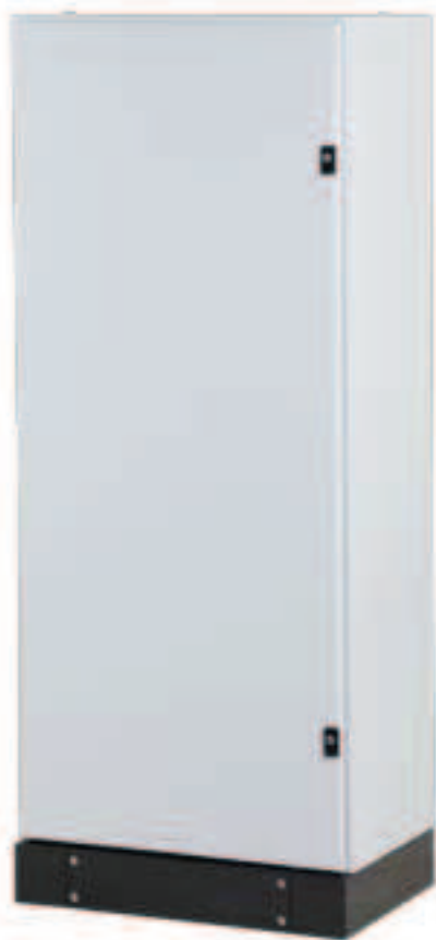
H=1200 e 1400