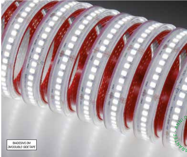
BIADESIVO 3M 3M DOUBLE-SIDE TAPE